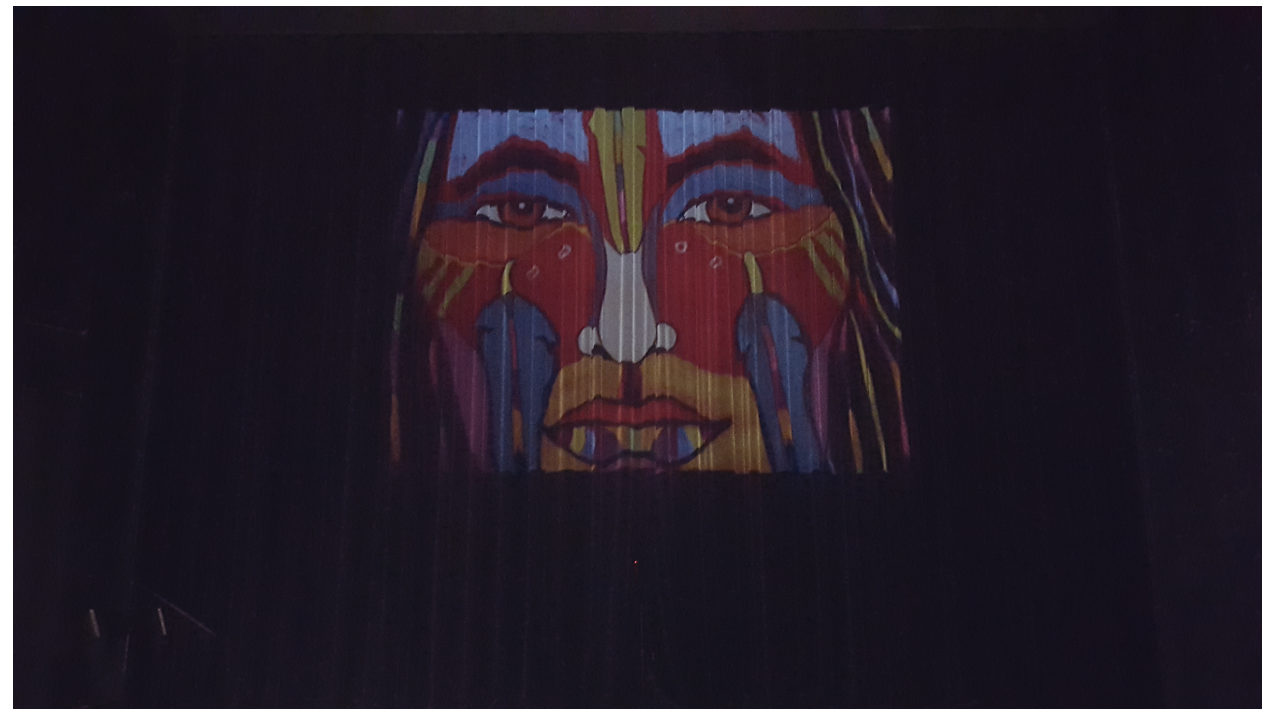
Opening scene from 'New Blood'

On March 15, I attended the official launch of Indigenous Canada – a new, free, 12 module Massive Open Online Course (MOOC) that has been developed by the Faculty of Native Studies in partnership with various indigenous people to tell their history and current issues in their own words. The course can be accessed at <u>https://www.ualberta.ca/courses/indigenous-canada</u>. The evening was a celebration of the two years of hard work to bring this course to fruition and the many, many people who participated and helped in its creation. As part of the celebration, there were performances by Cree singers, drummers, male and female dancers, and an Inuit throat singer and everyone was invited to participate in a round dance!